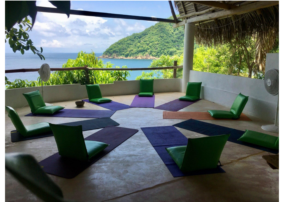
Movement and Ceremonial Space at Pura Vida Wellness Retreat Center