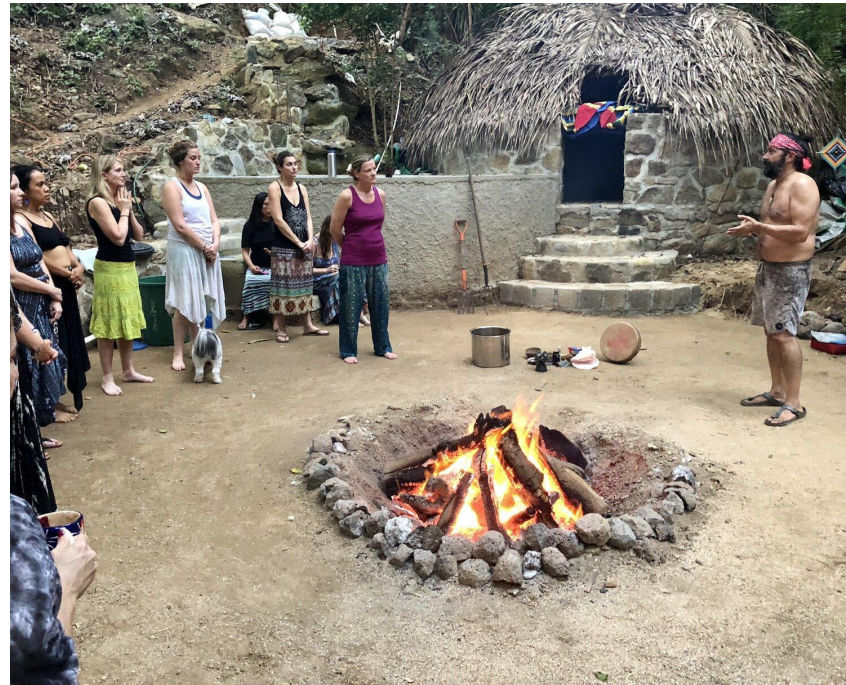
Temazcal at Pura Vida Wellness Retreat Center