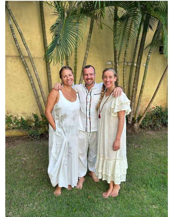
Puerto Vallarta facilitators