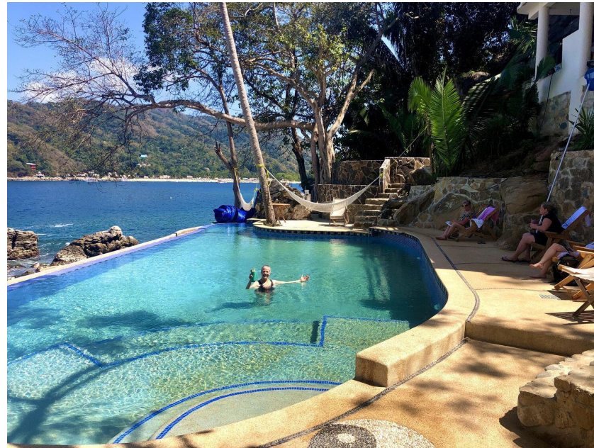
Swimming Pool at Pura Vida Vida Wellness Retreat Center