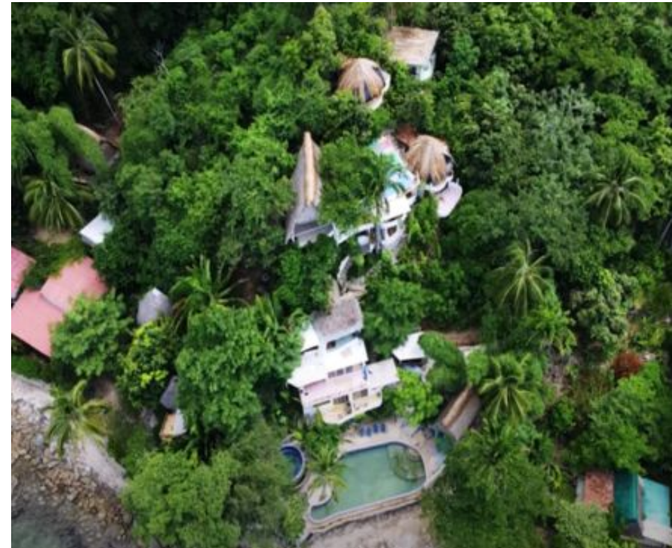
Aerial view of Pura Vida Wellness Retreat Center