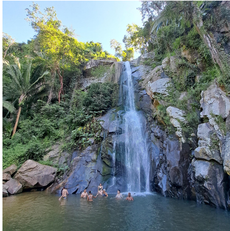
Waterfall in Yelapa