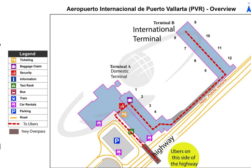
Map of PVR Airport