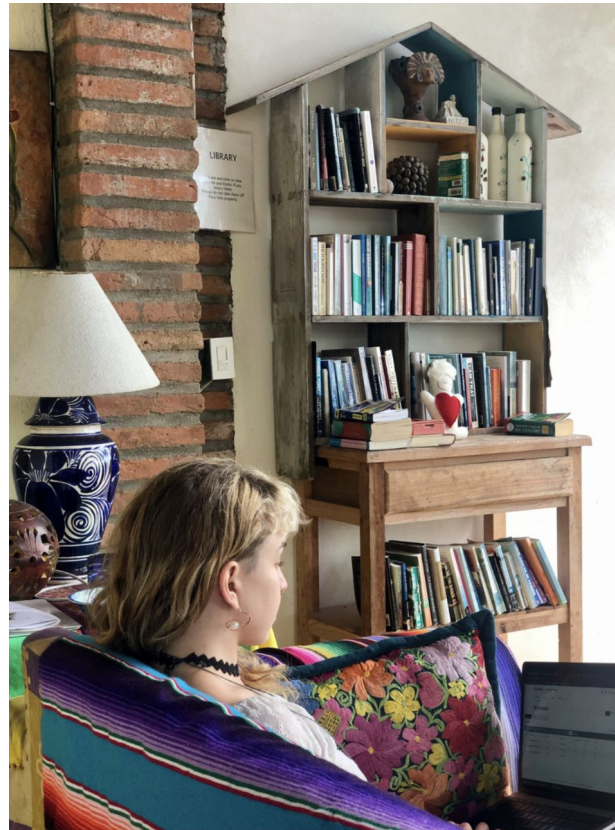
Library at Pura Vida Wellness Retreat Center